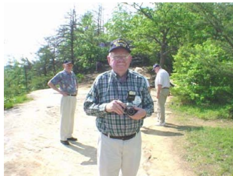
Top of the Natural Bridge