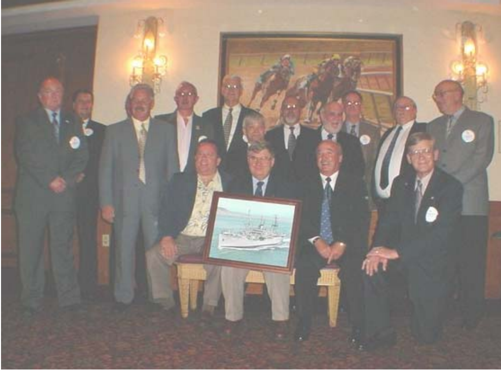
60's Crew Members