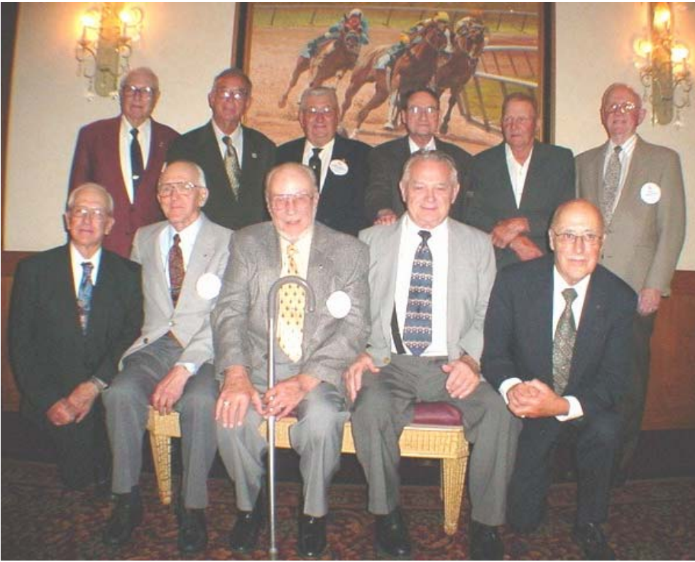
40's Crew Members