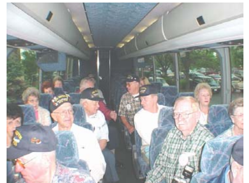
Our tour bus trip

This is just a small sample of the photos taken during our Reunion, Go to our web site usmagoffin.org for a larger group of photos