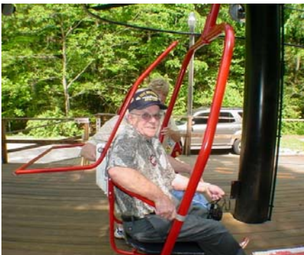
On the way to the top