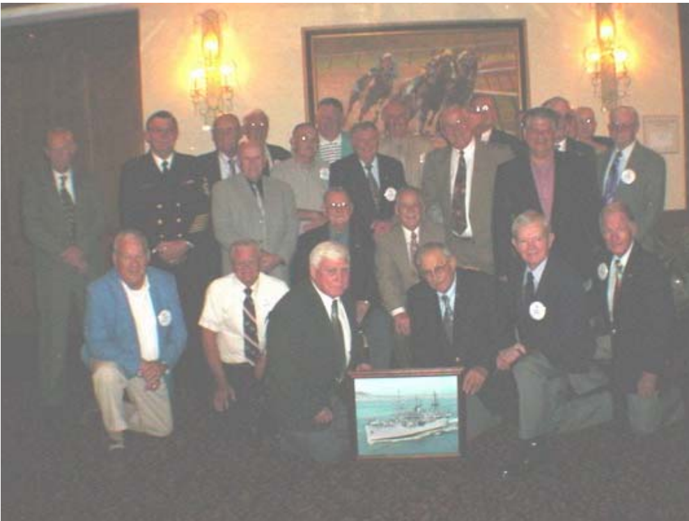
50's Crew Members