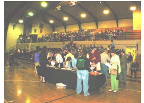
Magoffin County H.S. Gym